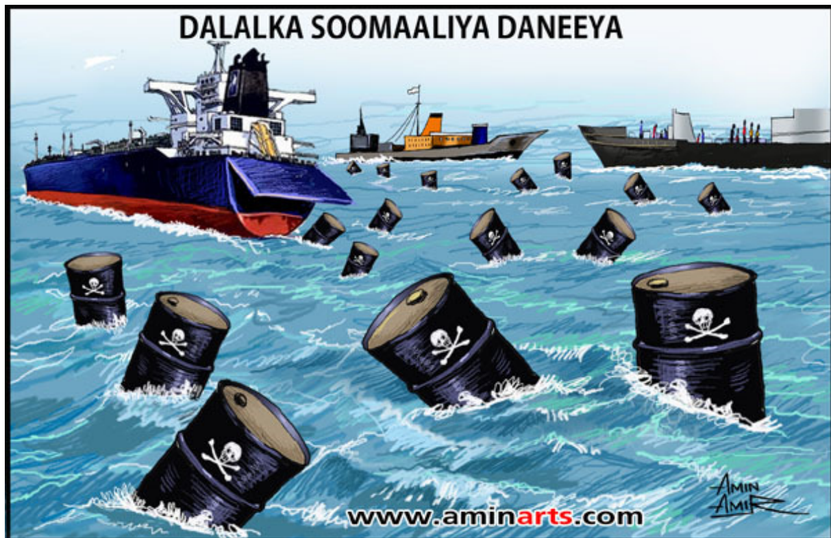
Figure 2. Toxic waste dumping by friendly countries as depicted by Somali Artst Amin Amir

The need to undertake collective efforts to raise adequate public awareness on these pressing issues both inside and outside Somalia has been another long-term common interest and passion with the late Ambassador 12 .