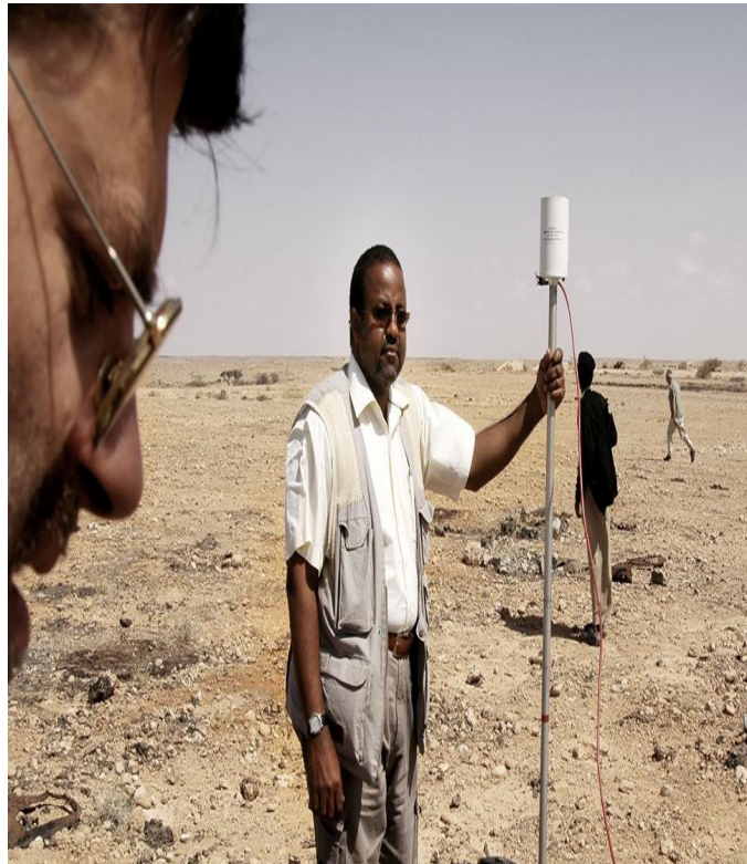
Figure 2. Amb. Bari-Bari holding an instrument to survey beneath the soil during 2005 mission in Somalia.

As reported by the Famiglia Cristiana 15 , Amb. Bari-Bari took part in four (4) international missions to Somalia between 2005 and 2007 in search of truth and justice. According to this account, thanks to Bari-Bari's diplomatic initiative, the Somali President had sent an official request to the Italian Government to jointly investigate and monitor the areas where the toxic waste had been dumped.